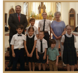
The Ranson-Able Scholarship

Congratulations to our scholarship recipients for the 2026-2027 school year! And thank you to the generous benefactors who fund the scholarships and help make Catholic education accessible to all students!