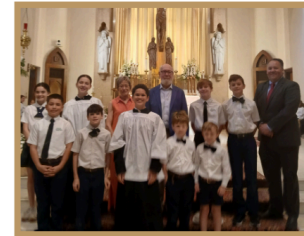
The Luker-Meyer Scholarship

ST. JOE'S MIDDLE SCHOOL YOUTH MINISTRY PRESENTS