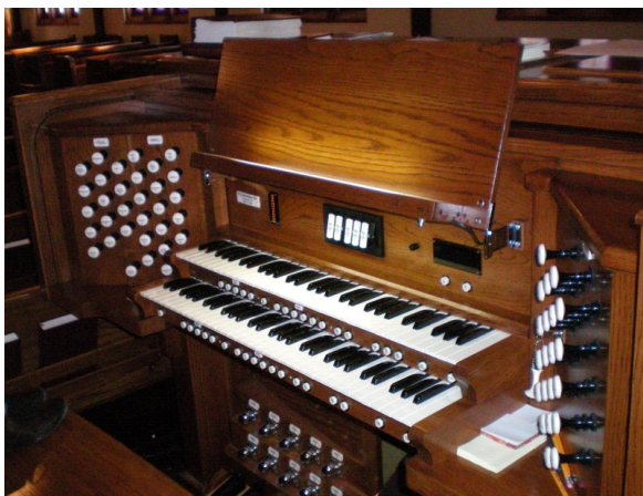
Wait! There's more!