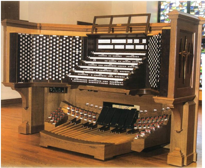
Organ consoles come in all shapes and sizes.