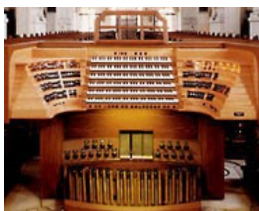
Stiftsbasilika Waldassen, Germany 141 ranks