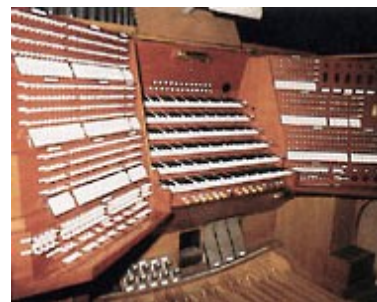
Mainz Cathedral Mainz, Germany 166 ranks