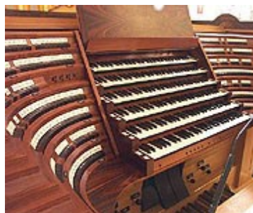
Lichen Bazylika Matki Bozej Lichenskiej, Poland 222 ranks