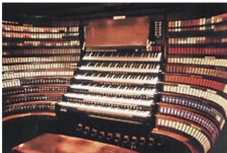
Macy's Wanamaker Store Philadelphia, PA, USA 463 ranks

FUN FACT: There are six, six-manual organs in the world.