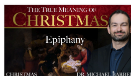
THE TRUE MEANING OF CHRISTMAS