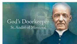
God's Doorkeeper St. André of Montreal