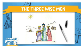
THE THREE WISE MEN

This week, we celebrate the memorial of a humble doorkeeper, St. André of Montreal. Learn how this man became a great saint through his small acts of love!