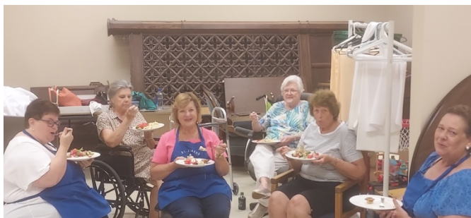
From Behind the Scenes of our Tea Room